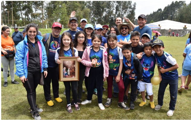
Family Camp. Ecuador

The evangelising action of the Province culminates the pastoral action of its members. For some years now, we have been trying to make our Schools and Colleges true Centers of evangelisation.