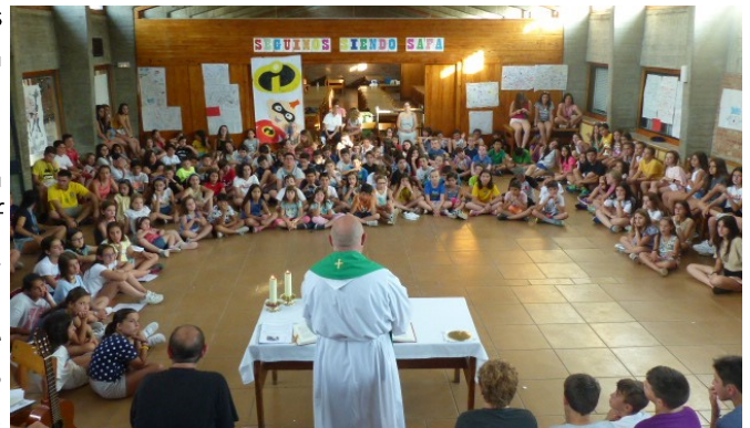
Christian group camp. Valladolid