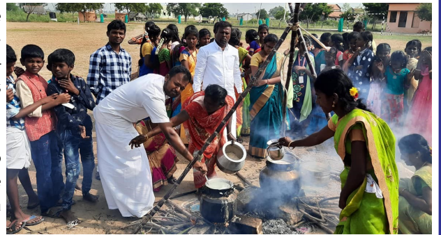
Pongal: harvest festival. India

Our standards have already implemented mechanisms to guarantee the meaning of the Province: a common Life Project, but adapted to each country and Community; a Province with two Delegations; a Provincial Delegate in each Delegation; a Provincial Council, but with an Advisory Council in the Delegations; an educational and pastoral mission managed as a network from a Team in each country; Houses of Formation in each country; the exchange of Brothers between