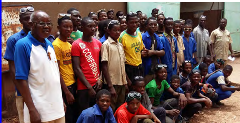
Educating out-of-school children and young people