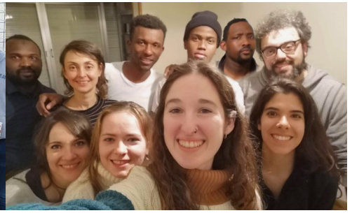
With immigrants at "Casa Nazareth"

In the previous issue we described the main activities of the NGO Carumanda directed at other countries. Solidarity initiatives with students in the Centres of the Province, and in other places where help is needed, are organised and carried out through the NGO itself, the Pastoral Departments, the Communities and Fraternities. In the Centres in Ecuador and in the Community of Bucaramanga (Colombia), there is also a sensitive solidarity activity. In several centres, there are groups such as Carumanda for young people and children, and solidarity groups in Puyo and Ambato.