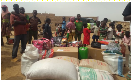
Children displaced with their families by terrorism receive donations.

Due to the threat of Terrorism, some seven hundred thousand( 700,000) inhabitants had to leave their homes and villages, and look for quieter areas. The Brothers and young people of the JASAFA of the "Little Taborin" help these families with some contributions in order to survive .