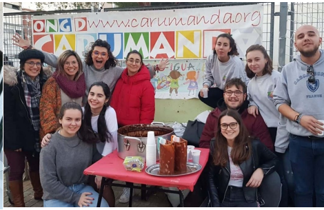
"Chocolatada" for Projects