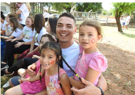
Young people from Brazil in Barrio Fatima

Brazil. Ibema. "Donate a toy, get a smile". Helping families in need.