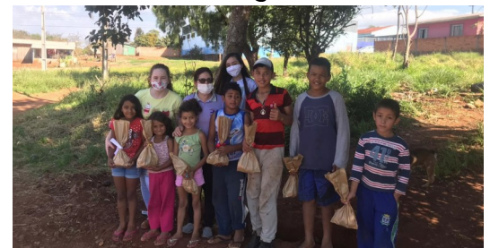
Visiting poor neighbourhoods

School. San Juan Bautista. School support or neighborhood recreation. They prepare and distribute food. Recreation groups and catechesis in neighborhoods.