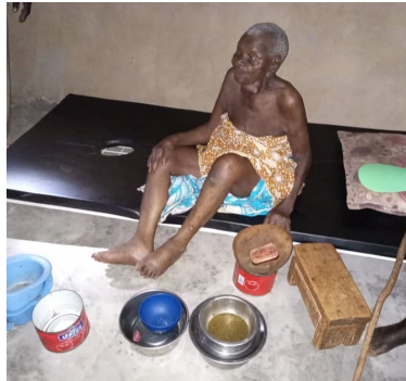
A 102 year old woman is alone in the village of Sâaba in her house rebuilt by the FPT.

The FPT operates on the basis of donations in kind and in cash, offered by men and women of good will and students of the Brothers of the Holy Family. The young apostle of the Holy Family animates the life of the FPT in schools, villages and towns of Burkina Faso. The various donations constitute a fund managed by a national Bureau in collaboration with the Provincial Treasurer.