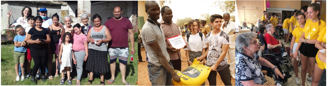
With a newly arrived gypsy family