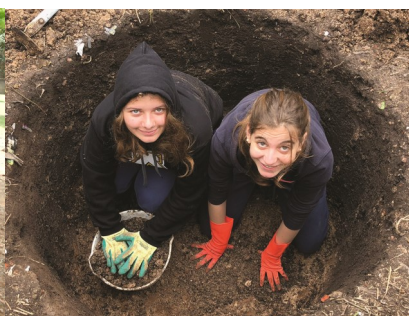
Making a well