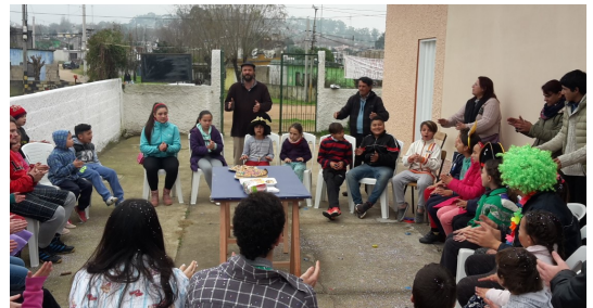
Animation and recreation with children

In order to educate in solidarity, it is necessary to offer occasions that allow the student to go out of himself/herself to help others by performing works of service; to put him/her in contact with pain and illness; to show him/her that there are other people who have basic needs not covered or who are going through difficult situations; to make him/her see that he/she has to prepare himself/herself to help in the construction of a world in keeping with the dignity of all people.