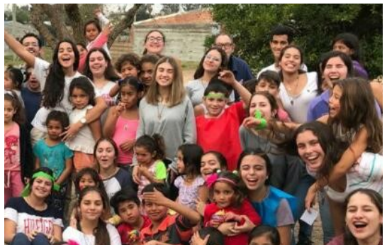
Picnic area and games with children