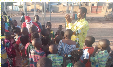
A Brother celebrates the Holy Family with displaced children.