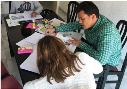
School support for protected children